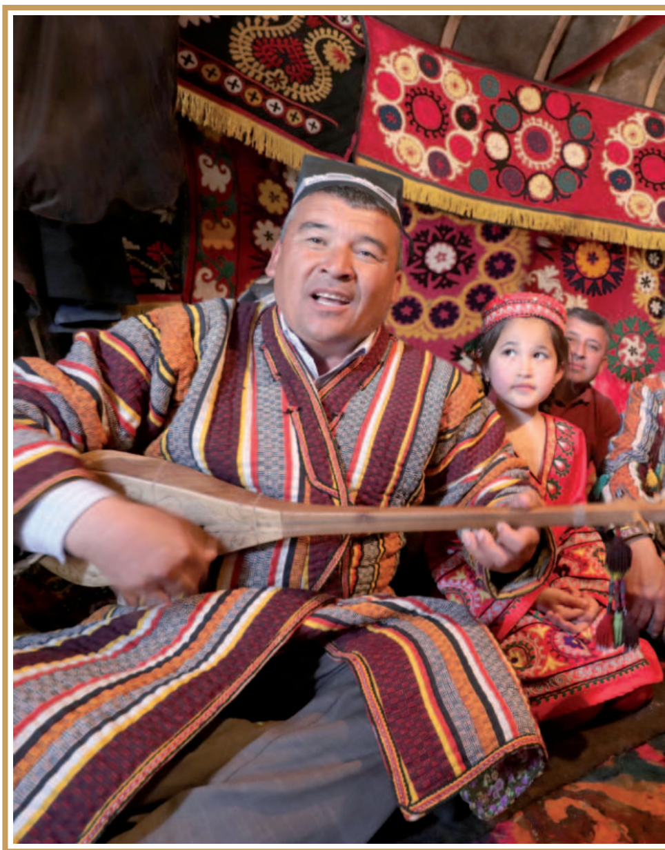
Boysun's cultural heritage in Surkhandarya region and Uzbek "Shashmakom" are included in a list of intangible masterpieces of UNESCO's World Cultural heritage.