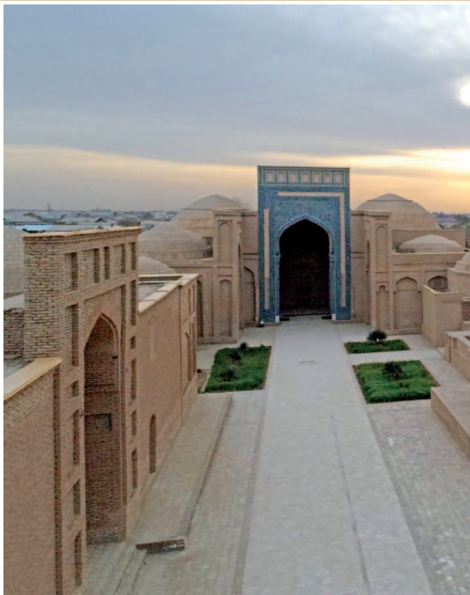
The Sultan-Saadat memorial and cultural complex is the family tomb of the descendants of the Prophet Muhammad. The formation of the complex began in the 9th century with the construction of the mausoleum of the founder of the Termez Seyid family of Sufi sheikh Hassan al Amir.