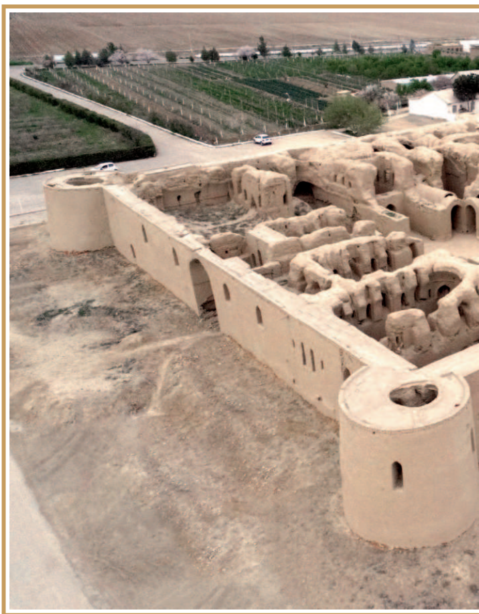
The Kirk-Kyz fortress is located on the western side of Termez, and is a square structure of adobe bricks with powerful towers located in the corners.