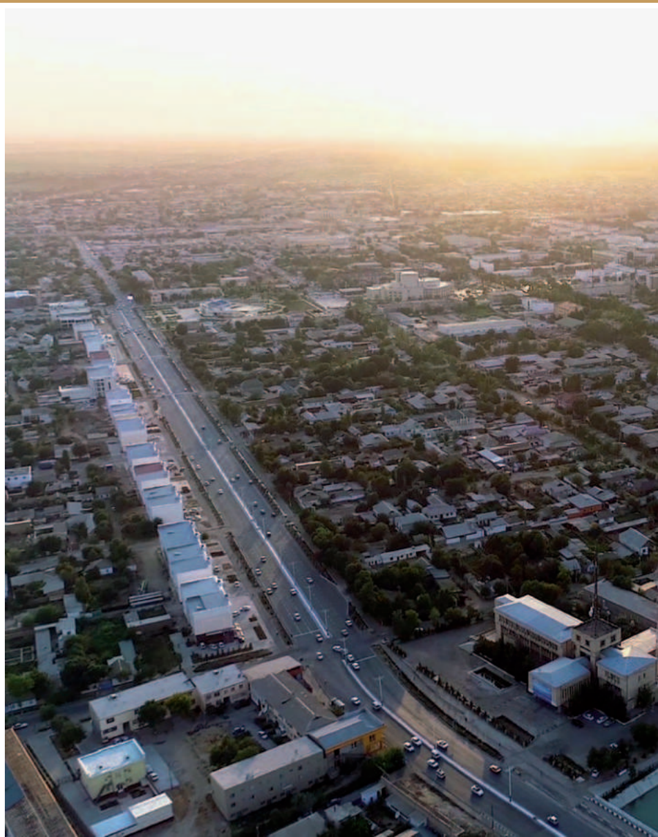
Located in the very center of the former Hungry Steppe, the city of Gulistan was formed in 1961 as the administrative and cultural center of the Syrdarya region, thanks to the construction of the railway and the Achchi Kukduk station in the second half of the 19th century.