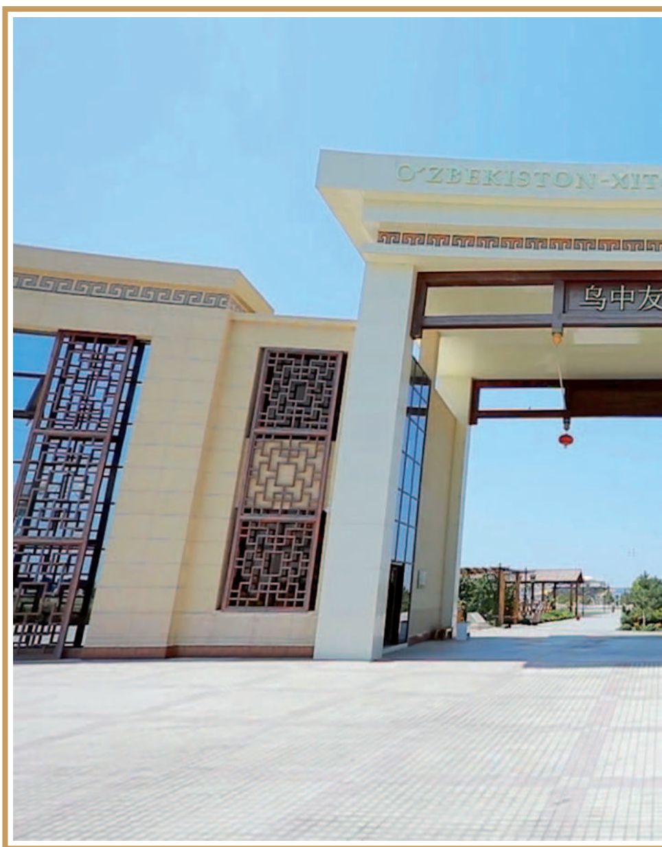
Since 2017, in the territory of the Jizzakh free economic zone Uzbek-Chinese friendship park is open for visiting.