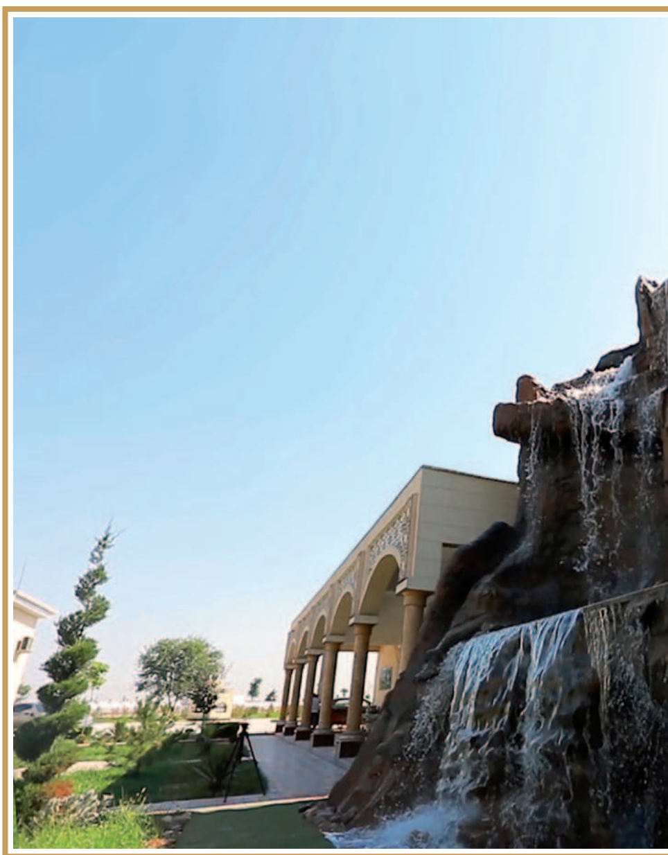
In the Syrdarya region, various culture and recreation parks operate for pleasant leisure of the population and guests of the region.