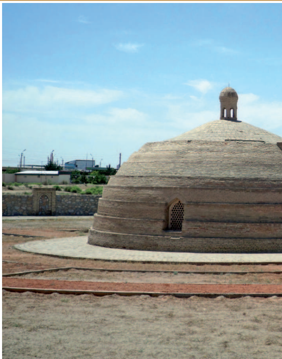
In the Sardoba region of Syrdarya, there is an ancient historical monument named "Sardoba", designed to store water. Since time immemorial, such structures have been built on trade caravan routes.