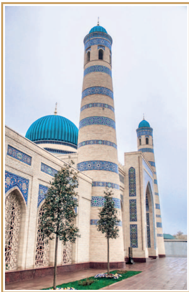
The Marifatli mosque in Zaamin is one of the ten largest mosques in Uzbekistan.