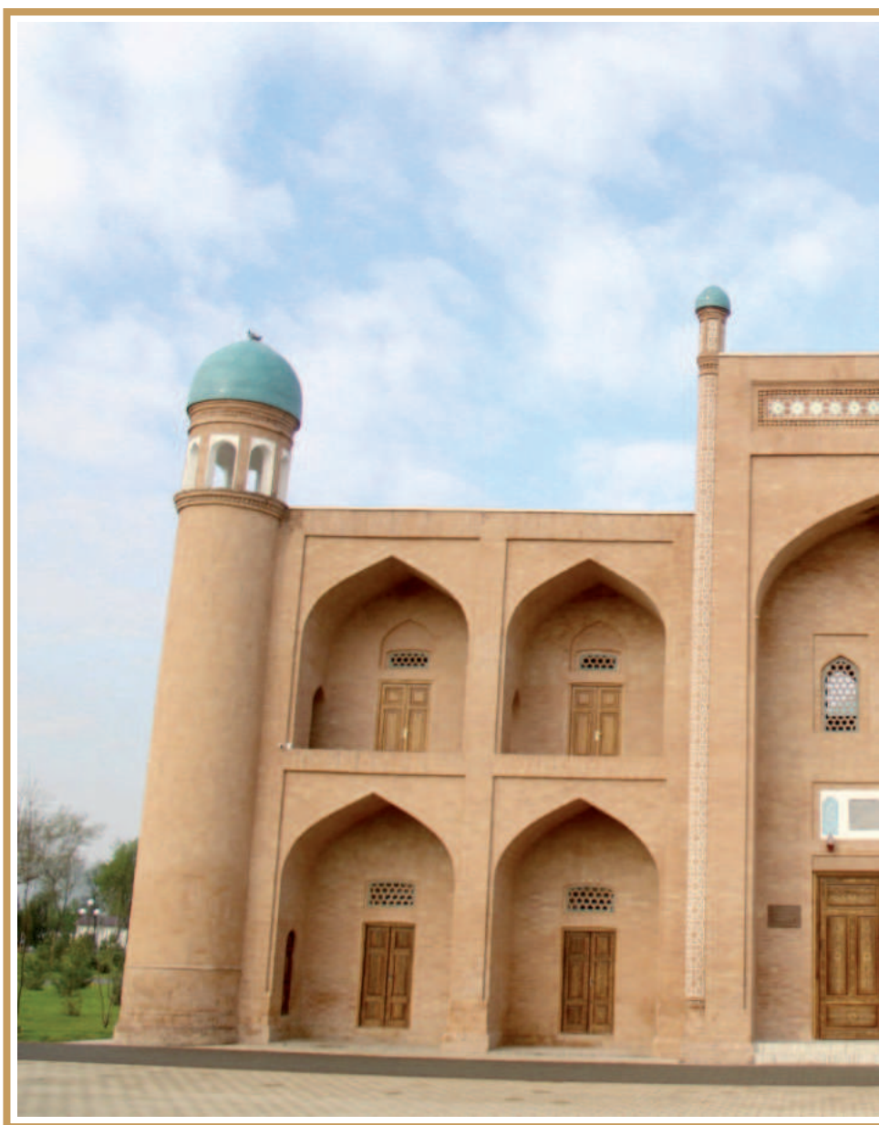
Memorial complex dedicated to the outstanding poets of Uzbekistan Hamid Alimjan and Zulfiya in Jizzakh (2017).