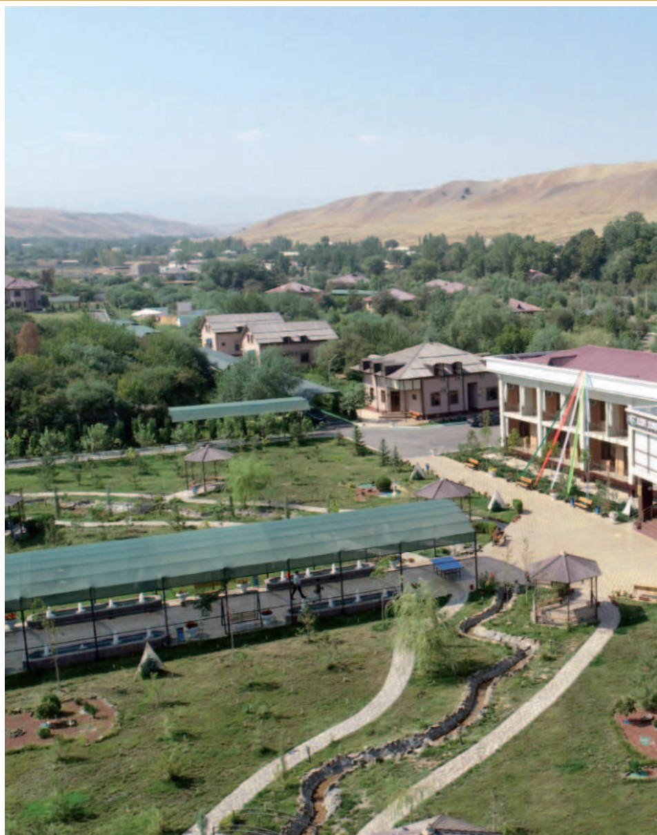
Modern health resort Zaamin offer a full range of services for health restore.