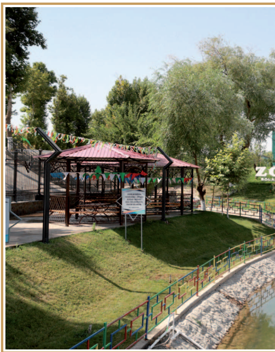
"Zomin bolalar oromgohi" - children's summer camp in Zaamin.